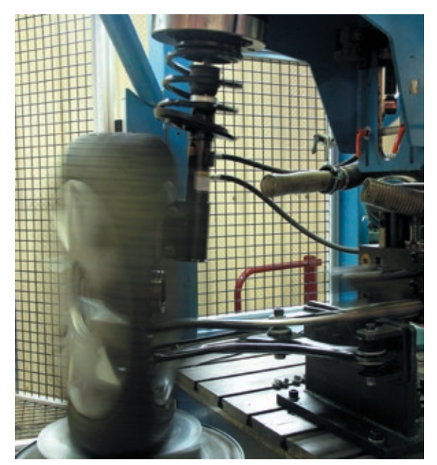
Life cycle test bench

Each product is then tested at the test centre in order to meet the technical specifications of the different manufacturers.