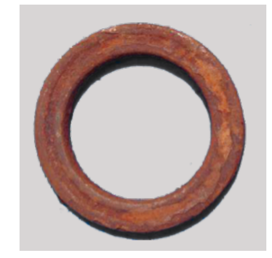
SUSPENSION BEARING CORRODED DUE TO INGRESS OF CONTAMINANTS