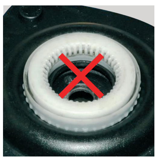
INCORRECT INSTALLATION STEERING SYSTEM ROTATION IMPAIRED